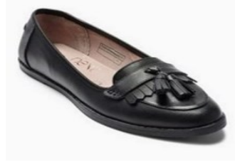
Polishable Shoe Black