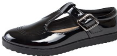
Plain Black Patent